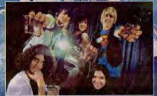
FAMILY MUSICIANS: Narangba band Freak Morice