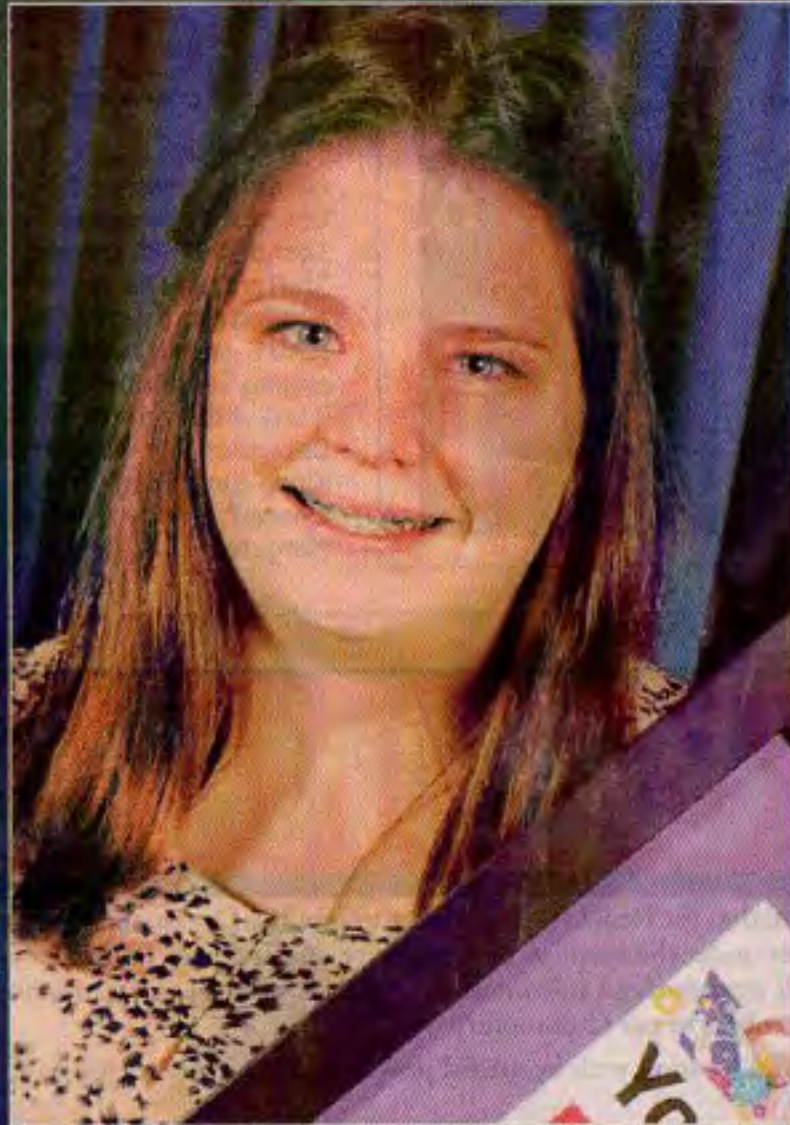
ADVENTURER: Saraya D'Ath